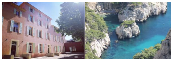
Spring School 2025 venue, CIRM, Marseille, France